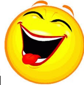
CHURCH OF THE COVERED DISH by Thom Tapp

Holy Hilarity reprinted with permission from the Joyful Noiseletter