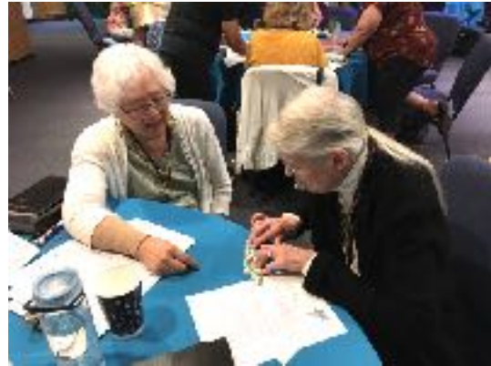
A teacher is helpful!