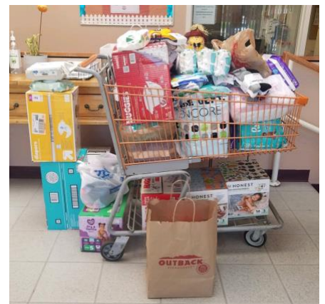
Donations for Action Center

Our next event will be the Mission & Mentoring event in January! See next article.