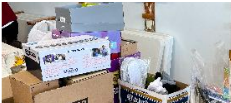
Donations were gathered and then packed for the One Nation Walking Together Christmas Shoeboxes Collection, sent to Native American Elders