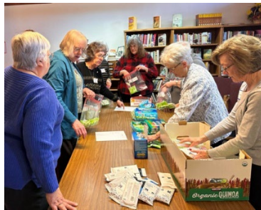
Making Period Kits

As I write this, it is a warm breezy day, bringing the first hints of spring. I can feel the excitement in the air, even though I know we have at least two more months of winter weather. But the feeling is there, something new is happening. A month ago our district met at Littleton UMC for our annual Mission & Mentoring Day . Fifty-five women, representing 15 churches in our district, shared a day of asking questions, learning new things, meeting other women in the district who may have the same office that we hold, and sharing smiles. We made 50 "period kits" that were sent to the Wesley Center at CU and to help some local immigrants. We worked together and learned together.