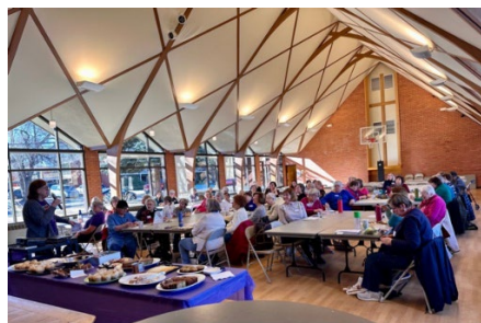
Littleton UWFaith hosted us